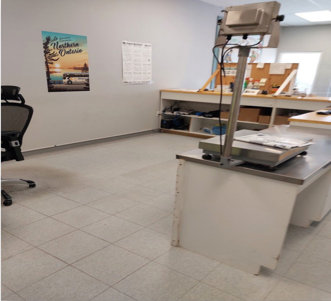
Image: Reception Counter