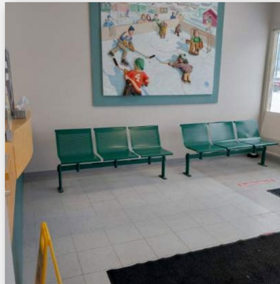
Image: Reception Waiting Area