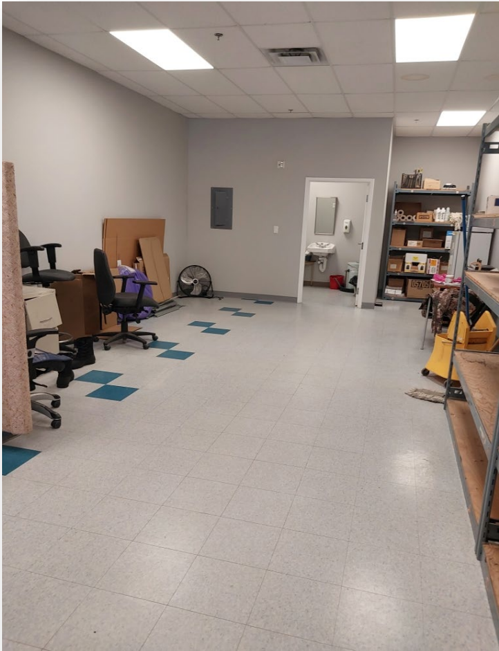
Image: Parcel/Storage Area