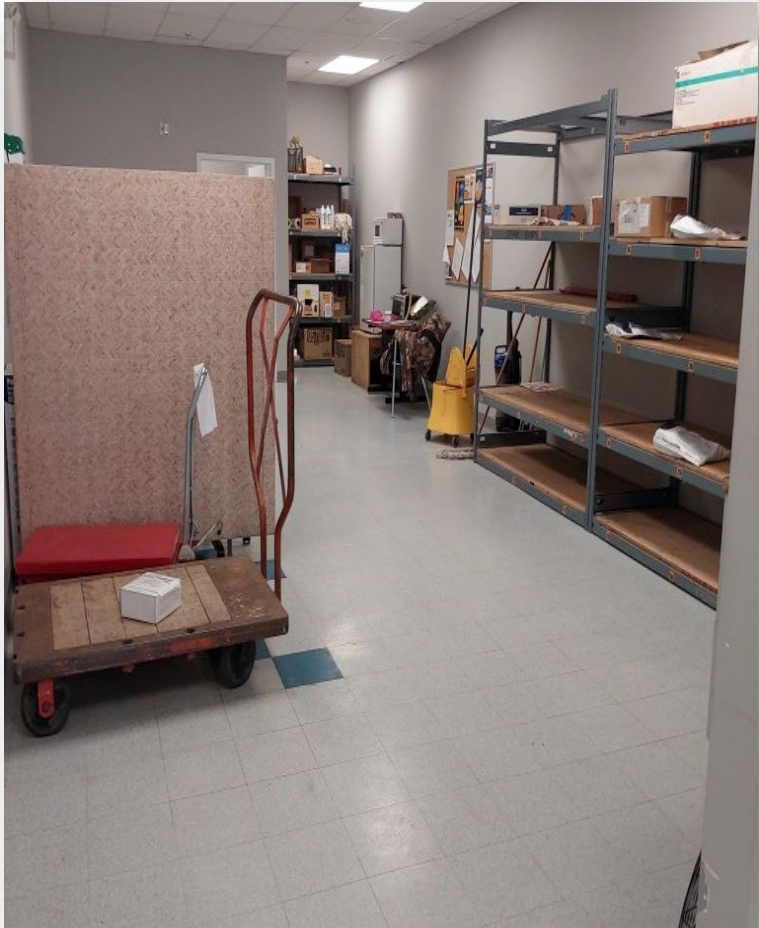
Image: Parcel/Storage Area